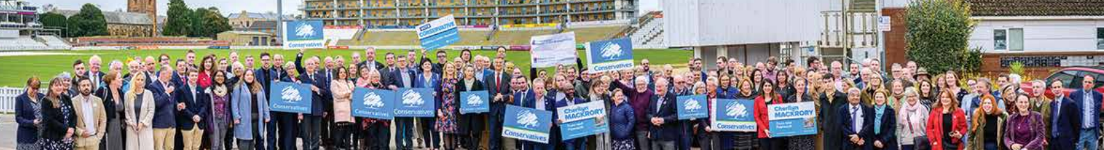
Some of the 250 attendees at last year's South West Regional Conference, organised by myself and my Regional Team